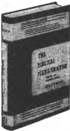
VOLUME I Matthew — 708 Pages