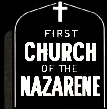
NEW REFLECTIVE FINISH

Constructed of 20-gauge steel, artistically die-cut to an over-all 23 x 30" size. Prime and base coats, silk-screen process, and a clear protective finish are individually baked on according to DuPont specifications to guarantee a long-lasting sign. White and golden-yellow lettering, applied by a special "codit" reflective liquid scientifically manufactured by Minnesota Mining Company, stands out against a rich blue background. Comes drilled with nine 3/16" holes for easy mounting on one center or two side posts. Weather-resistant. "Welcome," name, direction, address, or other desired lettering at no extra charge (one line—limited to eighteen letters including spacing) may be printed in white at top and or in lower panel. In either or both panels, should lettering not be desired, sign appears complete with space blank.