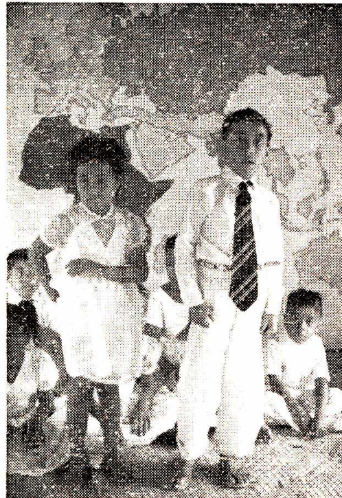
Children in American Samoa take part in a missionary skit. They sang, "Jesus loves the little children, all the children of the world."

Sharing in the returns through the Easter Offering are the overseas home missions areas. The story of the advance of the church in these lands is a modern Book of Acts. Keep our workers in these fields on your prayer list: Alaska, Hawaii, Panama Canal Zone, American Samoa, Australia, New Zealand, South Africa (European), Germany, Denmark, Bermuda, and the Chinese and Negro work in the United States.