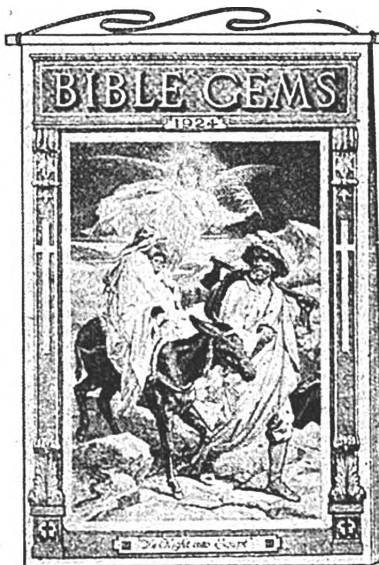
Size 10½x17½ inches.

THIS distinctive Scripture Calendar is indeed a work of art in every sense. It far surpasses any of the five previous editions of the "Bible Gems" calendar that we have printed. Read the following detailed description: