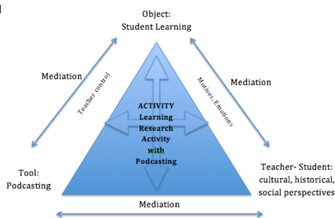
Figure 1: The CHAT Framework: Learning Research with Podcasting. Adapted from Vygotsky’s basic mediated action triangle (Yamagata, 2010, p.17).

developing his theoretical stance, Vygotsky’s underlying assumption of interactive relationships among subject, object and tool is that they change over time; they do not remain constant (Yamagata-Lynch, 2010). The need for nurses to be educated in the research process in determining best practice to mediate action is critical; the profession has been criticized for practicing from tradition, doing things as they always have done, as opposed to investigating what an activity should, or could, be. Utilizing the CHAT framework, the educator works with the students from where they are in knowledge and development in the professional role. Through the object-oriented activity, teachers provide an environment promoting connections among themselves, students, motivation, podcasting, and learning. The educator needs to follow the premise of Vygotsky’s Zone of Proximal Development (ZPD), allowing the students to engage in meaning making of complex concepts; contributing to the appropriate socio-cultural formation of their consciousness. The theoretical framework of CHAT incorporates the constructs of the research study well, as illustrated in Figure 1.